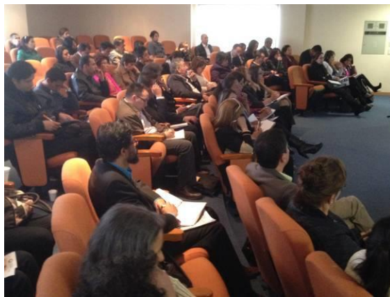
Audience of the CLCPA Workshop in Bogota