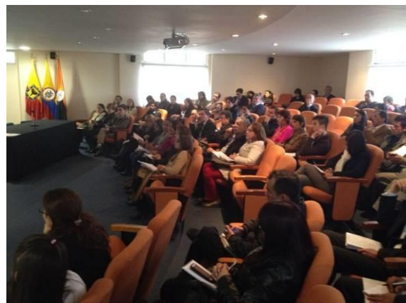
Around 60 people attending the workshop