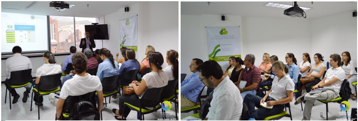
Meeting at the National Cleaner Production Center of Colombia.