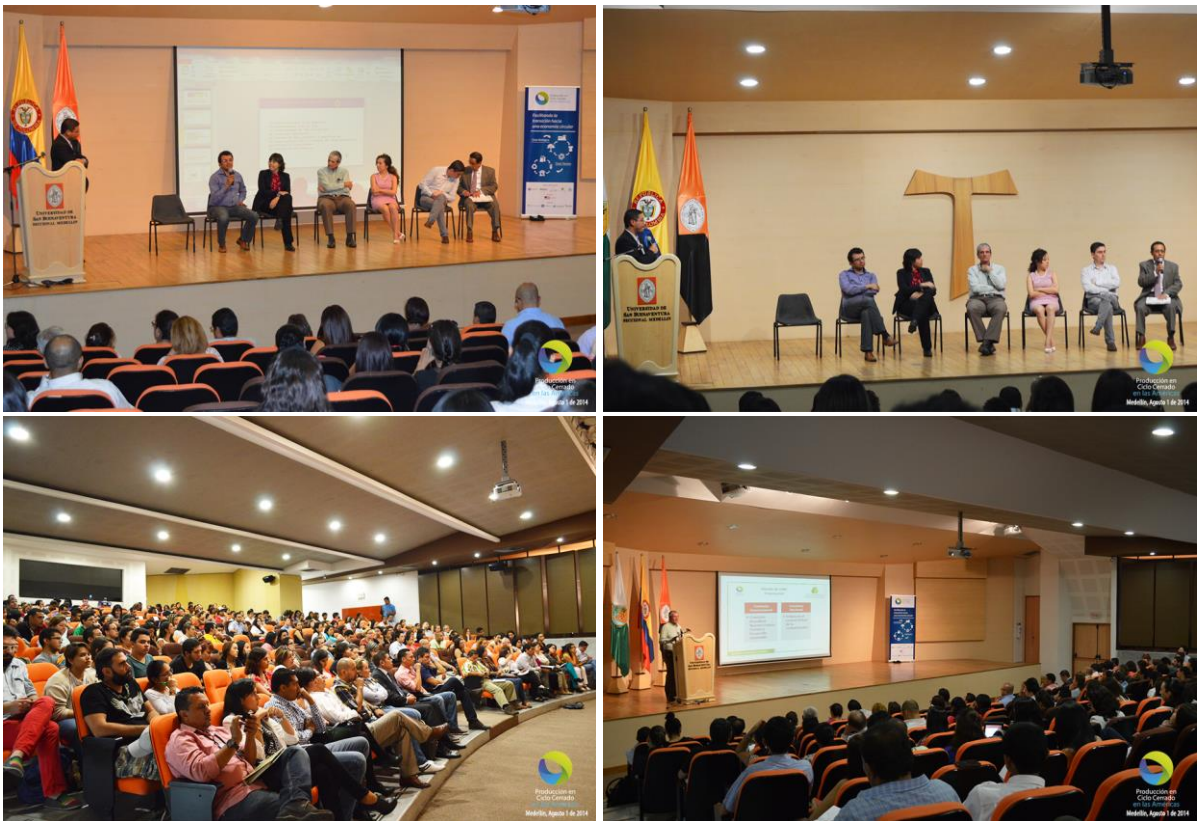
Panel session and audience of the CLCPA seminar in Medellin, around 350 people attended the CLCPA seminar.

Outcomes: An dynamic discussion took place among the panelists of which the conclusion was that it is important to obtain the know how of CLCP methodologies and example of their application in other countries as the Netherlands and the United States but also acknowledge that when implementing in Colombia it is important to adapt the methodologies to the local context and conditions of the country.