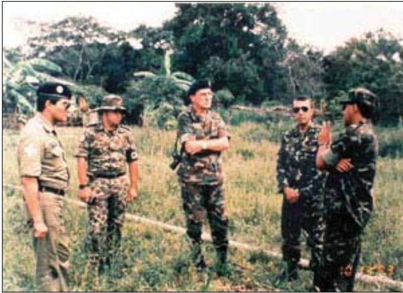
Officers from the Inter-American Defense Board during a 1991 visit to Nicaragua to assess the mine problem.

affected nation in the region, its staff also studied the landmine problem in Costa Rica, El Salvador, Guatemala and Honduras, all of which had seen the use of anti-personnel mines to some extent throughout the 1980s and had requested similar assistance.