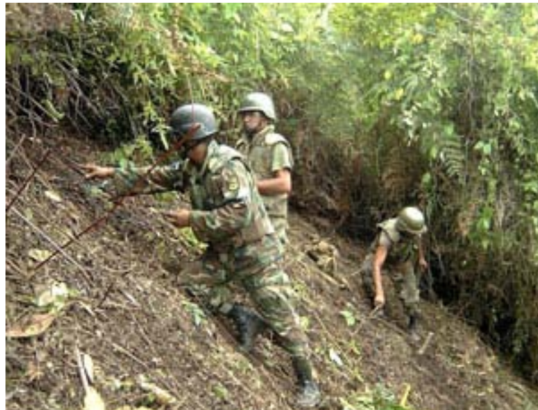
Nicaraguan deminers working in steep terrain in Nueva Segovia department.

Whereas the dimensions of the problem in Nicaragua were considerably underestimated, the extent of contamination in Honduras and Costa Rica was greatly overestimated. In both countries, initial clearance plans were based on the most reliable information available. Figure 1 illustrates that the first half of the period from the beginning of clearance operations until their completion resulted in significantly higher numbers of mines cleared than during the second half of the period. Even as clearance rates per deminer remained stable, the per-mine cost of operations sharply increased.